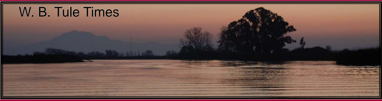
Amazing Winter Beauty in the Delta ... taken from Potato Slough looking towards Mt. Diablo